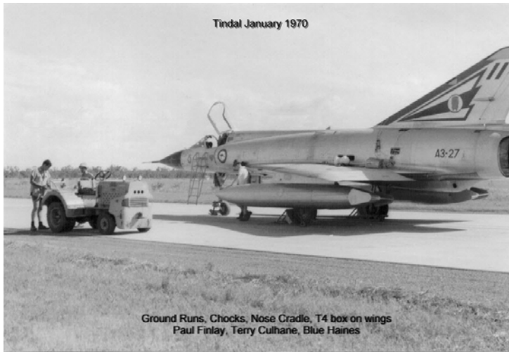
(A3-27 Ready For Ground Run. Note T4 test box on wing and cables to T4 probes. Personnel are Paul Finlay, Terry Culhane and Blue Haines, all Engine Fitters with 77 Sqn.)

becomes a sickly grey coloured rubbery thing which does not look like a finger and does not stand out so well under an ejection seat.