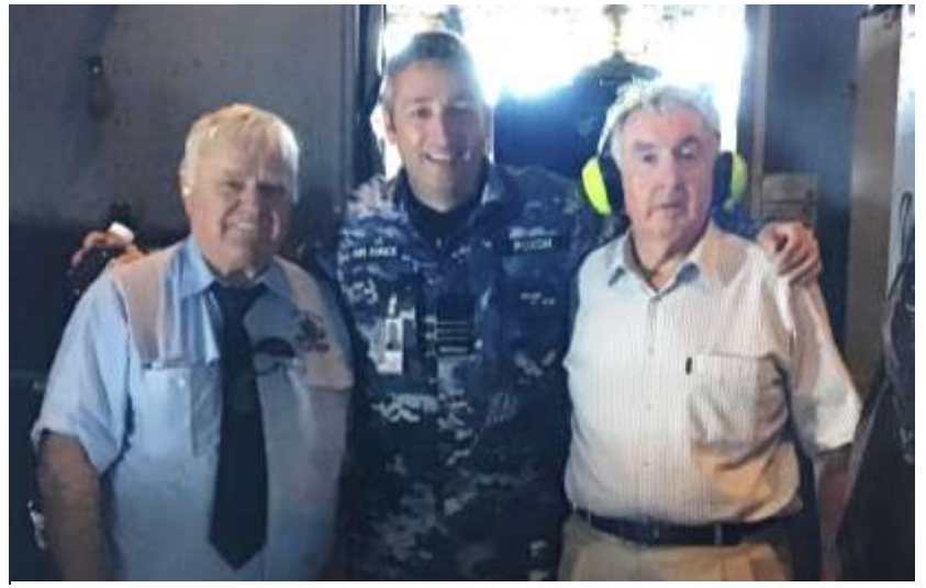
A couple of 'wallabies' with current CO 35SQN

On 1st June 1966 RTFV was renamed 35 Squadron and operational control for the squadron passed to the 834th Air Division of the USAF Seventh Air Force. Although the work was routine, flying in a war zone was still dangerous. The weather was often poor and aircraft were hit by enemy ground fire, wounding aircrew. Two aircraft were destroyed in landing accidents, while a third was destroyed in March 1970 by mortar fire at That Son air base, near the Cambodian border. In June 1971, three Caribous returned to Australia as part of the Government's decision to decrease Australia's involvement in the war and flying ceased on 13 February 1972. Four Caribous took off six days later and arrived at Richmond RAAF base on 26 February. 35SQN was the last RAAF unit to leave Vietnam. In its seven and a half years in Vietnam, 35SQN flew nearly 80,000 sorties (totalling 47,000 hours of flying time) and carried 677,000 passengers, 36 million kilos of freight, and 5 million kilos of mail. For their involvement in operations in Vietnam, members of 35SQN received a number of honours and decorations, including two appointments to the Member of the Order of British Empire, eight Distinguished Flying Crosses, one Distinguished Flying Medal, one British Empire Medal, and 36 Mention In Dispatches.