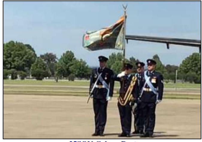
35SQN Colour Party

18 years later, RAAF Transport Flight Vietnam (RTFV), the antecedent of what was to become the new 35SQN, was raised in Butterworth on 21 July 1964 to support the